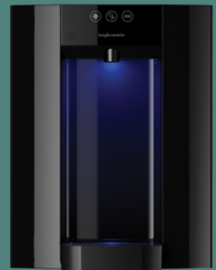
Black - Countertop