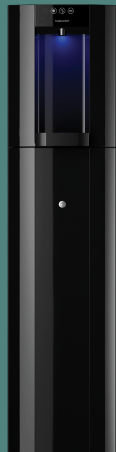
Black - Freestanding