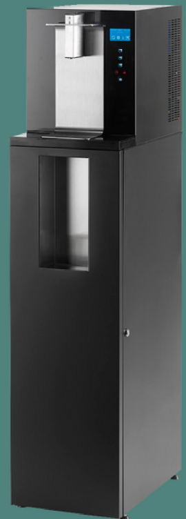
Black - Freestanding