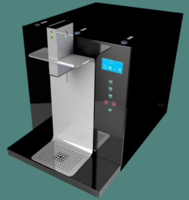
Black - Countertop